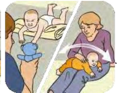
If your baby doesn't like tummy time on the floor, try tummy time on a rolled-up towel, your lap or large ball.