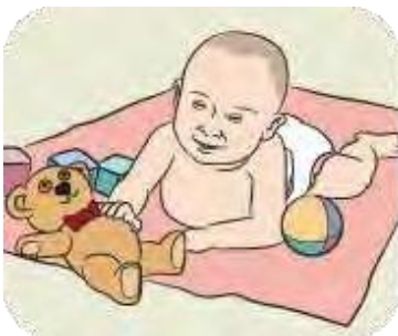
Place safe objects and toys close to your baby. Move them from side to side in front of her face. This encourages her to move, lift and turn her head.