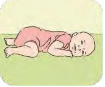
Tummy time happens when your baby lies on his tummy with weight on his forearms. Tummy time builds head, neck and upper body strength for when baby is older. Your baby should do it a lot each day.