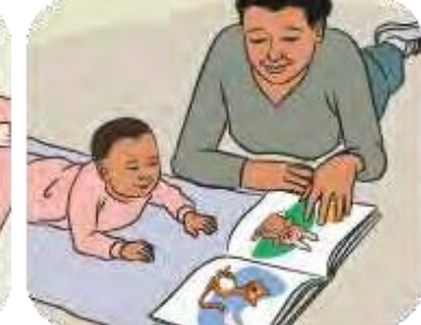
Get down on the floor next to baby. Turn pages in picture books or magazines. This develops baby's eye strength and keeps her interested.