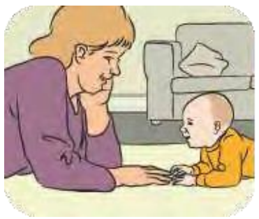
Let your baby know you're there by talking and singing, stroking his back or tickling his hands.