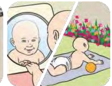
Put a non-breakable mirror next to your baby so she can see her reflection. Try tummy time in different places, like outdoors on a blanket.